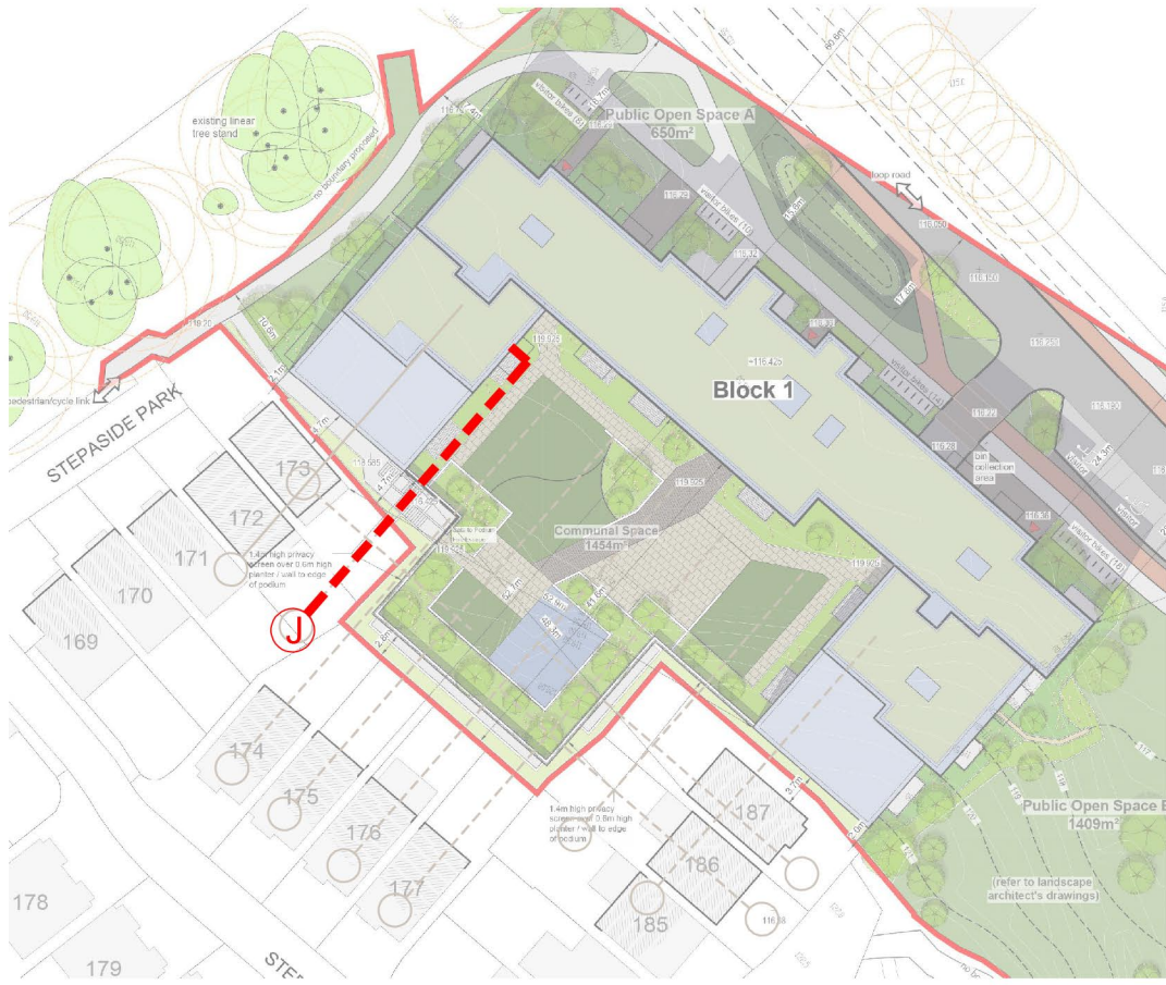
KEY PLAN INDICATING POSITION OF SECTION LINE J-J NOT TO SCALE

SEE ENGINEER'S DRAWINGS FOR DETAILS ON SUBSTRUCTURE SEE LANDSCAPE ARCHITECT'S REPORT FOR BOUNDARY TREATMENTS